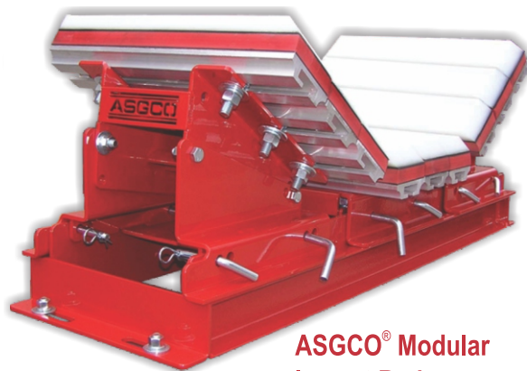
ASGCO® Modular Impact Beds™