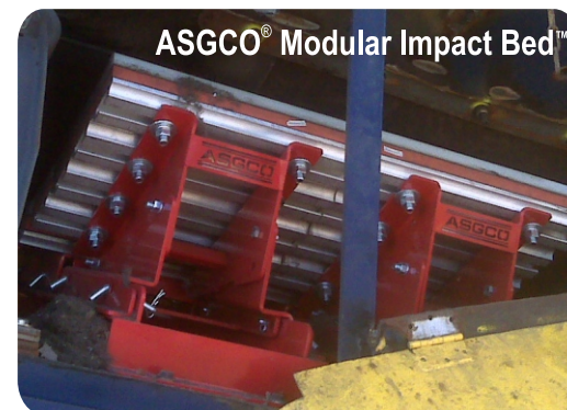
ASGCO® Modular Impact Bed™