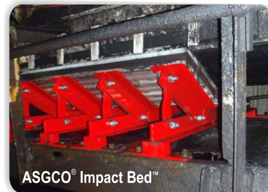
ASGCO® Impact Bed™