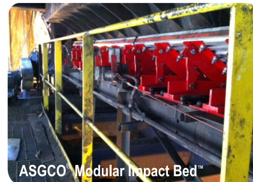
ASGCO® Modular Impact Bed™